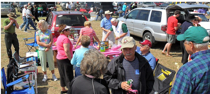
Tailgating at our railside spot for the annual Aiken Trials horse races