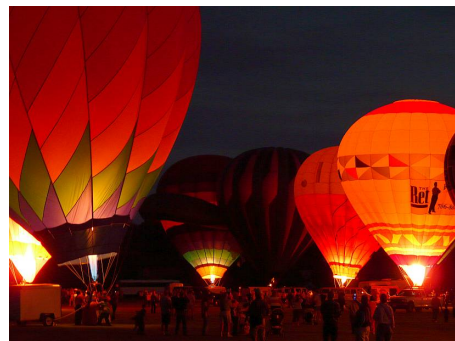
"Balloon Glow" event in Aiken last September