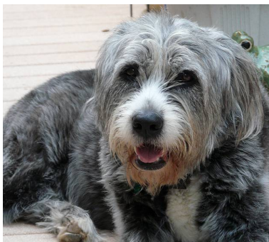
Cookie is almost twelve now and is hanging in there pretty well