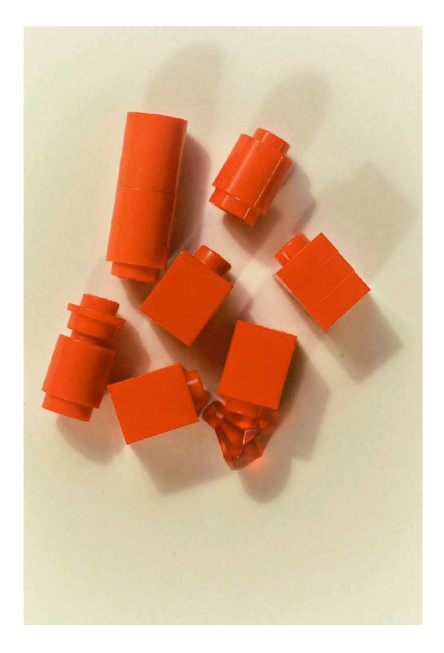
6-12 inches (finer resolution)

The photograph on the left was taken with a 100 mm lens from three to four feet away. The picture on the right was photographed with a 100 mm macro at a distance of six to twelve inches. As the magnification increased, the resolution also became better. One of the objects in both pictures is actually three connected Lego® pieces. It is impossible to determine in the left side picture (poor resolution) but feasible in the right side picture (fine resolution).